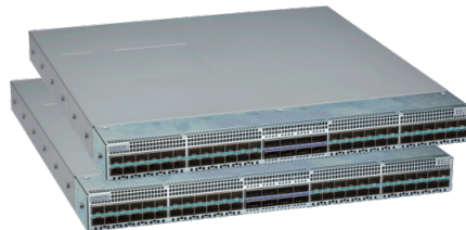
Arista 7050SX3-48YC8 and 7050SX3-48YC8C : 48x 25G SFP and 8x 100G QSFP ports

The Arista 7050SX3-48YC8 and the 7050SX3-48YC8C are 1RU systems with 48 ports of 25G SFP and 8 ports of 100G QSFP100 with an overall throughput of 4 Tbps. The high density SFP ports can be configured to run either at 25G or a mix of 10G/1G speeds. The QSFP ports allow for 100GbE or 40GbE as high speed network uplinks, with a wide choice of transceivers and cables enabling a choice of combinations for both leaf and spine deployment. With low latency and no oversubscription, the switch is optimized for high performance server and storage deployments.