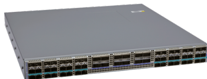
Arista 7050SX3-48YC12 : 48x 25G SFP and 12x 100G QSFP ports

The Arista 7050SX3-48YC12 is a 1RU system with 48 ports of 25GbE SFP and 12 ports of 100GbE QSFP100 with an overall throughput of 4.8 Tbps. The high density SFP ports can be configured in groups of 4 to run either at 25G or a mix of 10G/1G speeds. The QSFP ports allow for a choice of 5 speeds including 100GbE, 40GbE, 4x10GbE, 4x25GbE or 2x 50GbE with a wide choice of transceivers and cables enabling a choice of combinations for both leaf and spine deployment. With low latency and no oversubscription, the switch is optimized for high performance server and storage deployments.