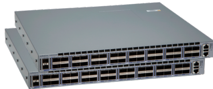
Arista 7050CX3-32S and 7050CX3-32C : 32x 100G QSFP100 ports, 2 SFP+ ports

The 7050CX3-32S and the 7050CX3-32C are 1RU systems with 32 100G QSFP100 ports offering wire speed throughput of up to 6.4 Tbps bi-directional. Each QSFP port supports a choice of 5 speeds with flexible configuration between 100GbE, 40GbE, 4x10GbE, 4x25GbE or 2x50GbE modes for up to 128 ports of 10GbE and 25GbE or 64 ports of 50GbE. All ports can operate in any supported mode without limitation, allowing easy migration from lower speeds and the flexibility for leaf or spine deployment.