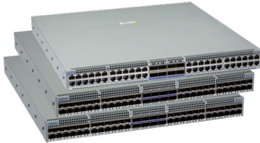
Arista 7050SX3-48C8, 7050SX3-48C8C and 7050TX3-48C8 : 48x 10G SFP or 10GBaseT and 8x 100G QSFP ports

The Arista 7050SX3-48C8 , 7050SX3-48C8C and 7050TX3-48C8 are 1RU systems with 48 ports of 10G and 8 ports of 100G with an overall throughput of 2.56 Tbps. The SX3 high density 10G ports can be configured for a mix of 10G/1G speeds to facilitate mixed connections and the TX3 RJ45 ports allows 1G, 2.5G, 5G, and 10G speeds. The QSFP100 ports allow 100GbE or 40GbE as network uplinks, with a rich choice of transceivers and cables for both leaf and spine deployment. With no oversubscription, the switch is optimized for high performance deployments with consistent features.