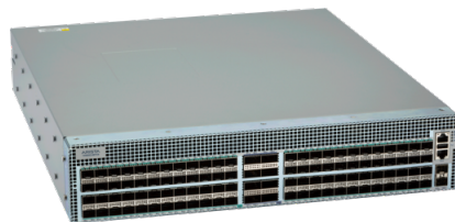
Arista 7050SX3-96YC8 : 96x 25G SFP and 8x 100G QSFP ports

The Arista 7050SX3-96YC8 is a 2RU system with 96 ports of 25G and 8 ports of 100G with an overall throughput of 6.4 Tbps bi-directional. The high density SFP ports can be configured in groups of 4 to run either at 25G or a mix of 10G/1G speeds. The QSFP100 ports allow for a choice of 5 speeds including 100GbE, 40GbE, 4x10GbE, 4x25GbE or 2x 50GbE with a wide choice of transceivers and cables enabling a choice of combinations for both leaf and spine deployment. With low latency and no oversubscription, the switch is optimized for high density server environments with native 25G connections.